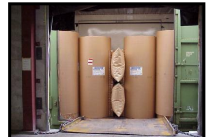
Exempt from doorway protection