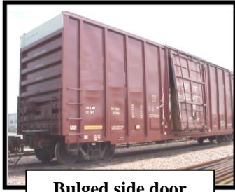
Bulged side door

Doorway protection is required to prevent commodities from moving into and through the doorway during transit. Such movement may result in pressure building up against the door which is a safety concern during transit and unloading. The pressure could result in bulged doors or doors being pushed open causing a safety hazard to the public or transportation employees during train operations and unloading.